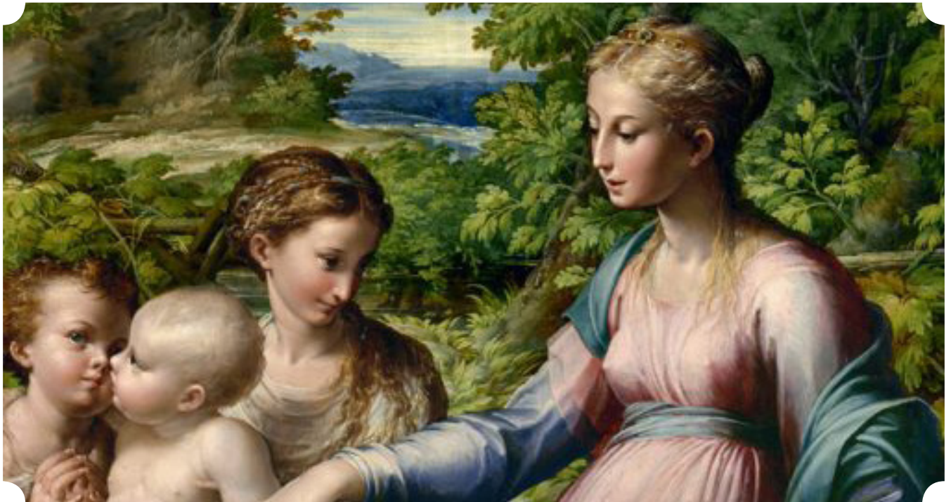
Image - Parmigianino - Virgin and Child with St. John the Baptist and Mary

Baptism is the holy act of reconnecting to the cosmic womb, to birth and rebirth through the sacred waters of the feminine womb. John played an important element in grounding the Way of Love and Christ consciousness through his role as a Rose Water Keeper. He was kinsman to both Mary Magdalene and Jeshua and had a powerful baptismal mystery school during their era. The school was located at the banks of the Jordan river, East Jerico. He baptised both Magdalene and Jeshua through the rites of the Holy waters of life. Some say that Mary Magdalene witnessed the baptism of Jeshua and recognised him at this moment. John the Baptist did full immersion baptisms that reenacted the birth process. He used the scallops shell as a water carrier which is symbolic of the vulva and yoni. He had an important connection to Mary Magdalene and to the holy family's Women line. This included Elizabeth, his Mother and his aunt Mother Mary. In fact his first baptism was in the womb during his first few months by Mother Mary, the Star of the Ocean.